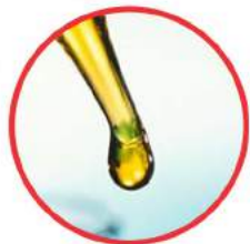
Exhibit Scope And Products